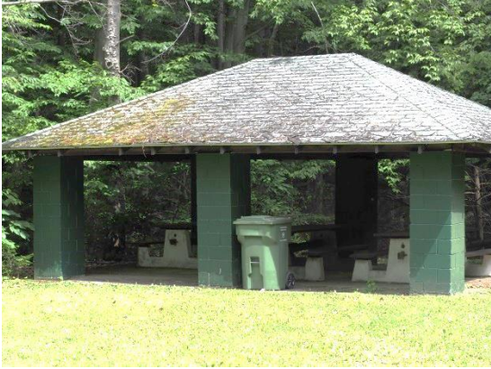
Sprague Brook Park Deteriorating Roof