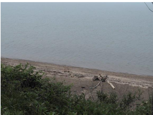
Wendt Beach Park View of Beach