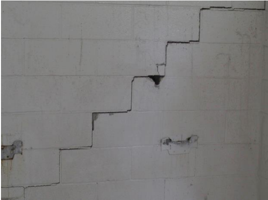
Chestnut Ridge Damaged Blocks