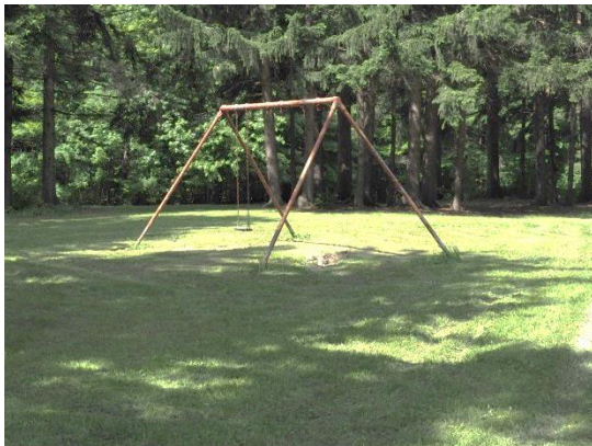
Emery Park Dated, Peeling and Missing Playground Equipment