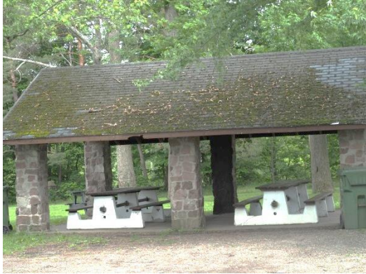
Como Lake Park Deteriorated Roof