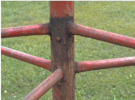
Sprague Brook Park Peeling Paint and Rust on Dated Playground Equipment