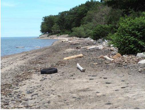
Wendt Beach Park View of Beach