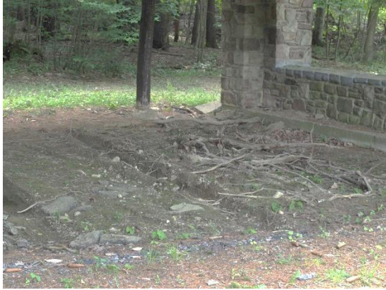
Emery Park Shelter Floor