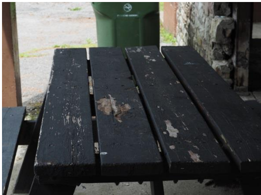
Como Lake Park – Peeling Paint on Picnic Tables