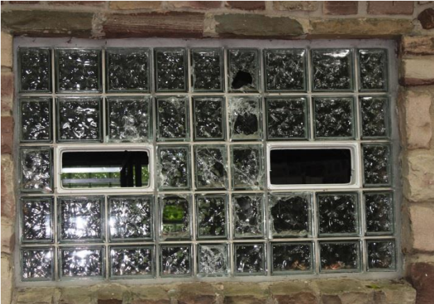
Chestnut Ridge Park Broken Glass Block Windows on Restroom