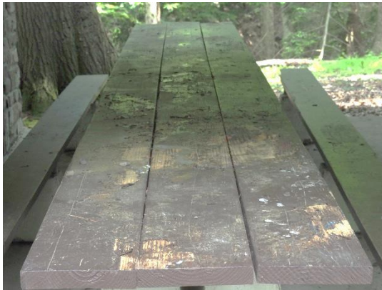
Chestnut Ridge Peeling Paint on Picnic Tables