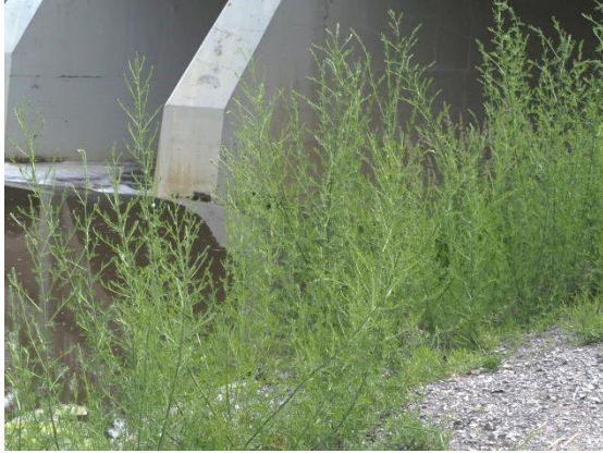
Akron Falls Path Drops Off to Falls