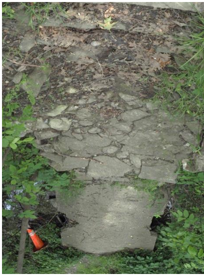
Como Lake Park Deteriorated Pathway