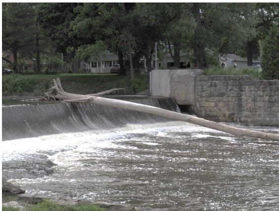
Como Park Lake