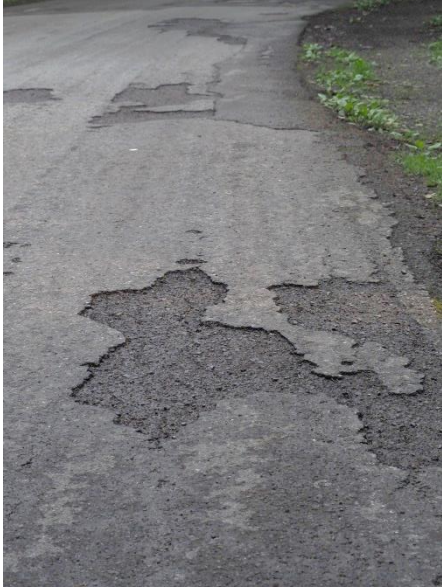
Chestnut Ridge Park Deteriorated Road