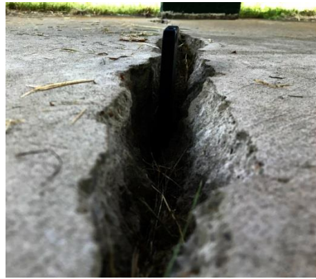
Emery Park Cracked and Uneven Flooring in Shelter