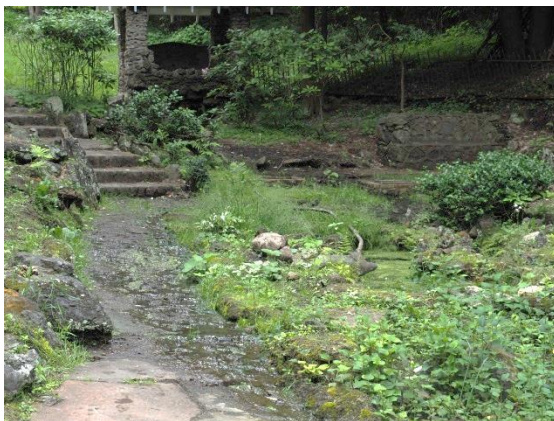
Akron Falls Rock Garden Drainage onto Pathway