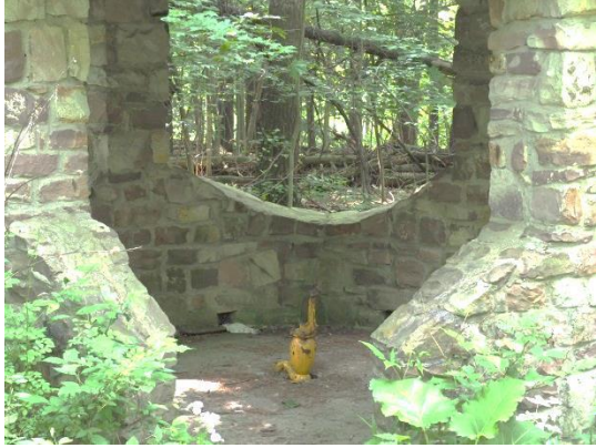
Chestnut Ridge Damaged Water Pump