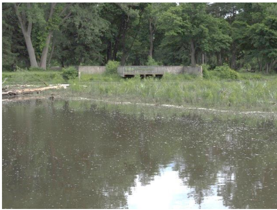
Como Park Lake