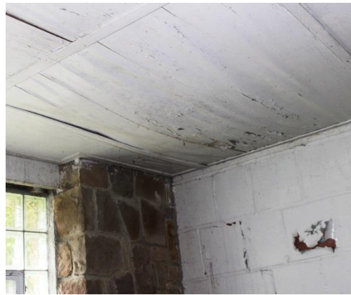
Chestnut Ridge Damaged Roof