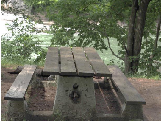
Scoby Park Peeling Paint on Picnic Tables