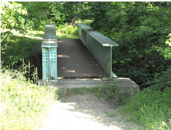
Chestnut Ridge Park Eroded Pathway