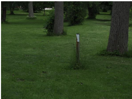
Como Lake Park – Damaged Frisbee Golf Signage