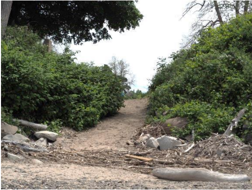
Wendt Beach Park View of Beach