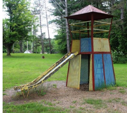
Akron Falls – Peeling Paint on Outdated Playground Equipment