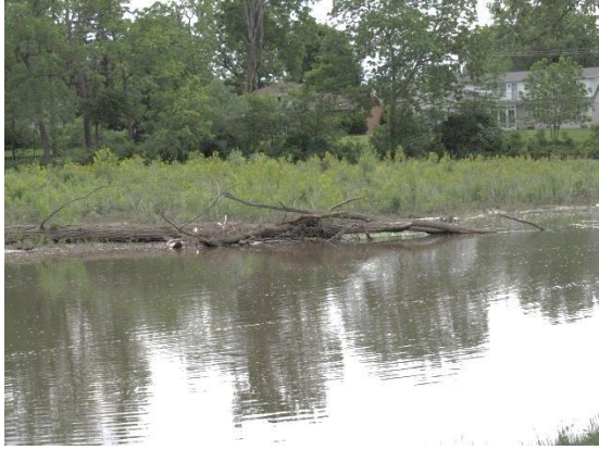
Como Park Lake