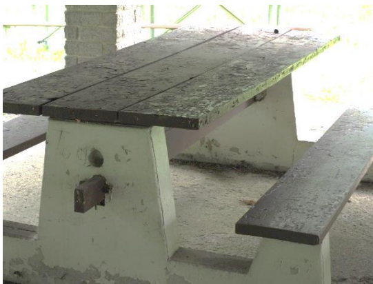
Sprague Brook Park Peeling Paint on Picnic Tables