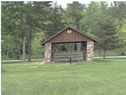
Como Lake Park Leaning Shelter