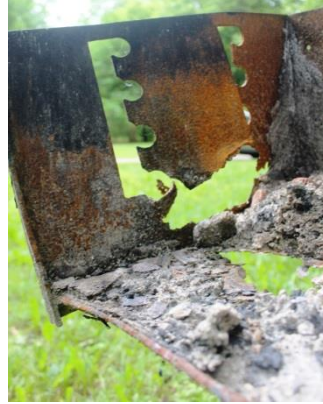
Akron Falls Park – Rusted Unusable Grill